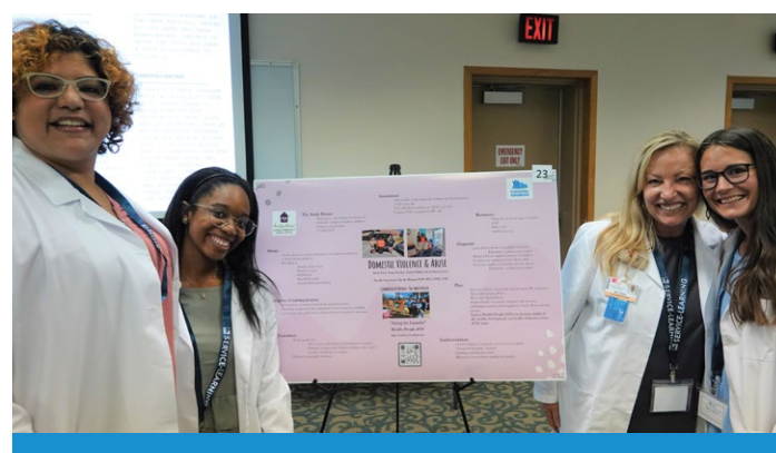
2022 SERVICE-LEARNING SYMPOSIUM