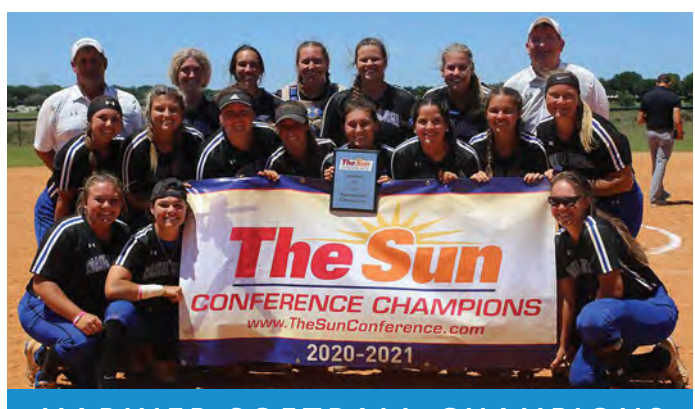
MARINER SOFTBALL CHAMPIONS