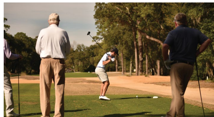
SUPPORTING MARINER GOLF