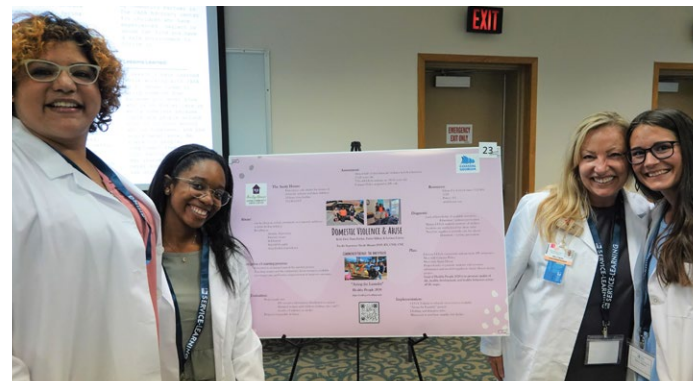
2022 SERVICE-LEARNING SYMPOSIUM