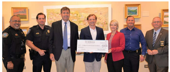
HONORING LAW ENFORCEMENT THROUGH THE TORRAS FOUNDATION SCHOLARSHIP

The mission of the Five Star Credit Union Foundation is to be a community resource for financial training, support programs for kids to succeed, and be a leader in helping communities move forward. The Five Star Credit Union Scholarship does just that by benefitting students of any major who are in financial need.