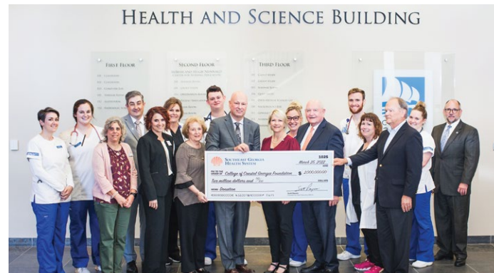
HEALTH AND SCIENCE BUILDING