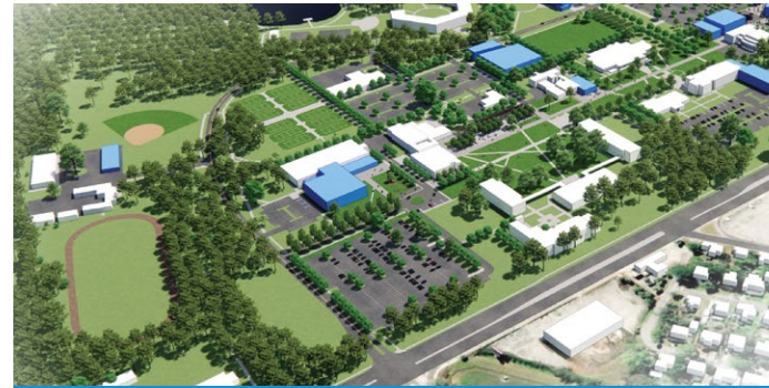
BRUNSWICK CAMPUS GROWTH SCHEDULED IN THE COMING YEARS